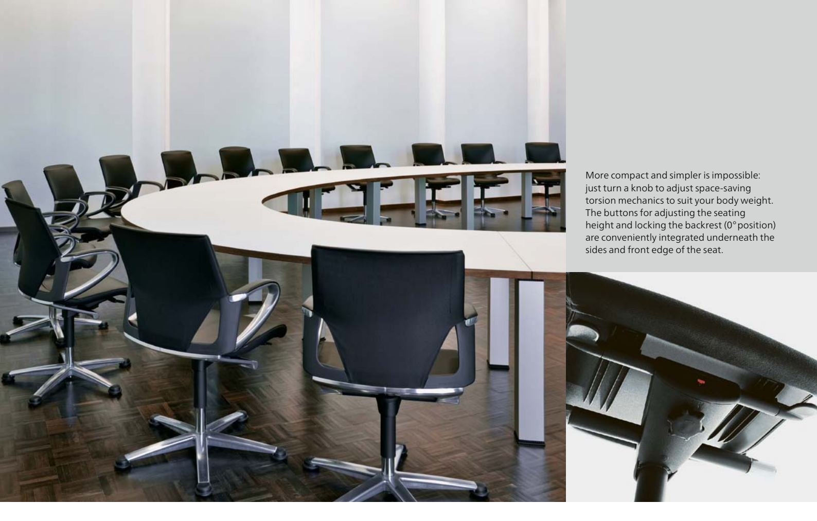
Modus Medium 281 / 5, backrest with non-transparent material