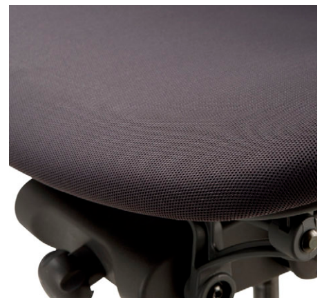
Multiple Fabric Options