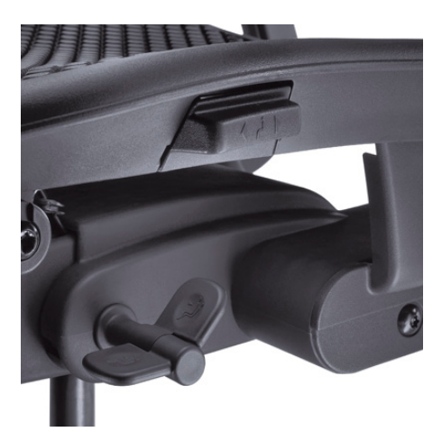
Full Range of Adjustments