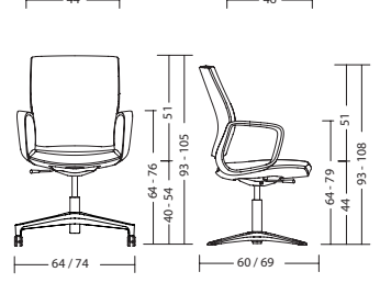
mot71 + 3238 / 3233 with arm supports: 16 kg