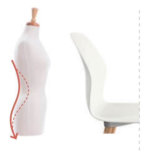
Developed for the human body.