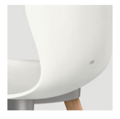
Ergonomic. The seat shell includes a lumbar curvature and seat pan which guarantees a healthy posture even when sitting for extended periods.