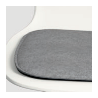
Removable. The premium seat cushion made of felt increases sitting comfort and also preserves the elegant lines of the plastic shell.