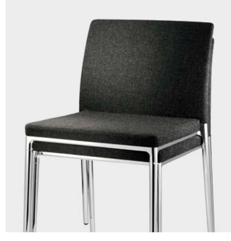
The seat pan is inserted into the frame, making the chair very comfortable and streamlined at the same time. The bottom also looks attractive too. As a result, up to six chairs can be stacked without causing any pressure points in the cushion.