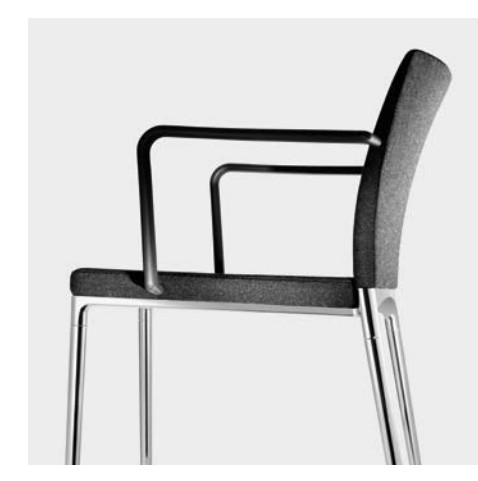
Further information at: www.wilkhahn.com/ceno