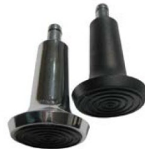
Pads (black or aluminium)

The chairs are equipped with adjustable 3D 360° armrests with two color options. The armrests are adjustable in width (70 mm), in depth (60 mm) and in height (100 mm). The height of the armrests from seat is 175-275 mm.