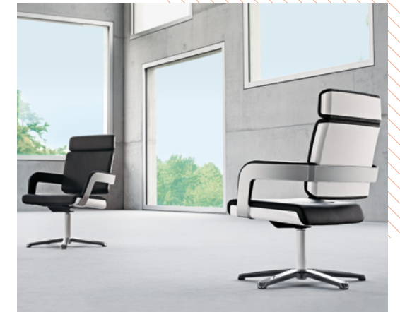
The Charta chair family conveys an aesthetic beauty across the board, making a strong statement in representative areas of the company.

Products: CHARTA executive task chair, CHARTA conference chair and PENSO.M