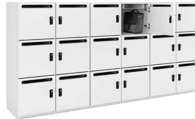
ACTA.PLUS lockers Storage options in mobile working environments.