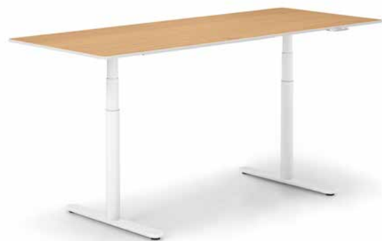
LIFE.S Conference Desk system available in different variants and designs.

Together with specialist retailers, König + Neurath supports its customers throughout the entire process of outfitting offices. With differentiated style collections, design-conscious furniture and digital solutions, the family-owned company, established in 1925, helps its customers to adapt successfully to the changing nature of the workplace.