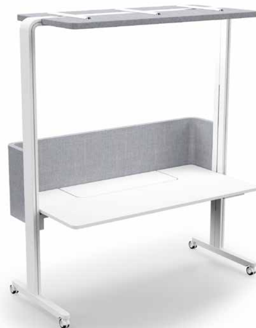
K+N STANDBY.OFFICE 2.0 Flexible, space-saving all-in-one solution for agile working methods.