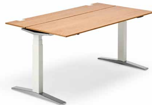
TABLE.T Sit/stand desk for a dynamic working position.