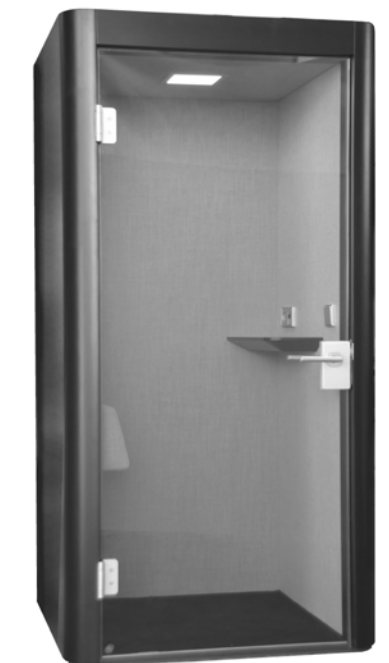
QUIET.BOX Organic Stand-alone furniture unit for more privacy in the office.