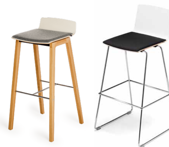
MOVE.MIX The special mixture: Bar stool with various types of base.