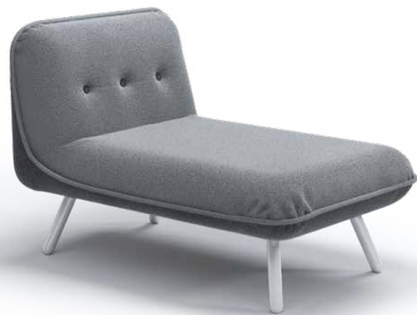
NET.WORK.PLACE Organic For creating communication areas within the office.