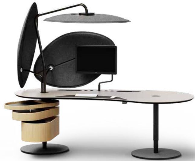
K+N BALANCE.OFFICE A harmonious working environment for your needs: on your own or as a team, for focused or communicative work.