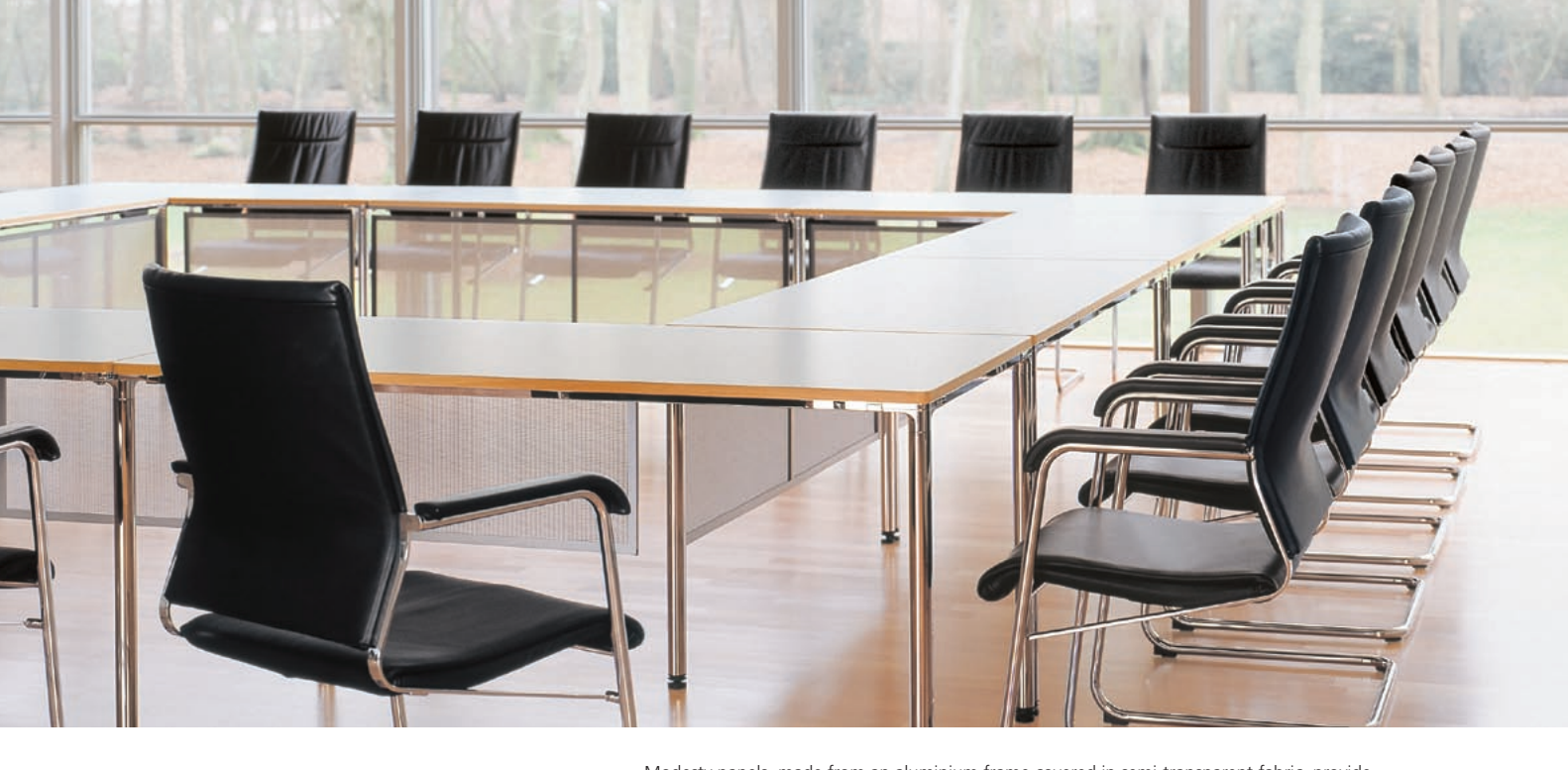
Modesty panels, made from an aluminium frame covered in semi-transparent fabric, provide a screen without changing the characteristic look of the tables.