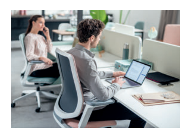
Focus on the job with se:flex.

The seat is also flexible and follows the movements of the pelvis. At the same time, the ergonomically shaped seat cavity offers perceptible support. Together, they result in a truly pleasant and active sitting sensation which encourages users to move. Moreover, the seat can be moved both forward and back to accommodate different leg lengths.