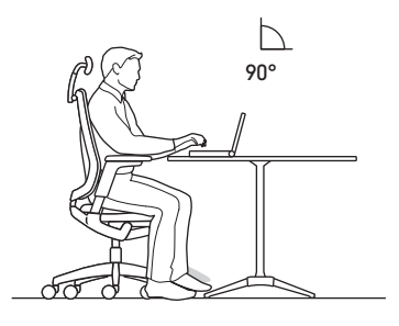
Sit upright and concentrate. A perfectly balanced backrest pressure ensures ideal support at all times.