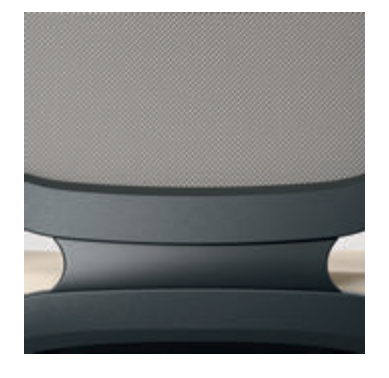
Flexible. The backrest follows the lateral movements of the user flexible in all directions and offers optimal support.