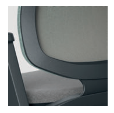
More comfort. Instead of the innovative mesh membrane, the backrest can also be equipped with slim upholstery