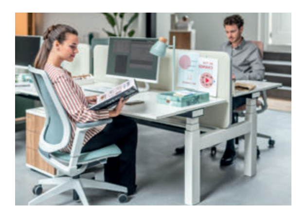
Relax and lean back and with se:flex.