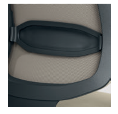
More support. The optional comfort lumbar support features a flexible filling to increase the individual ergonomic comfort level.